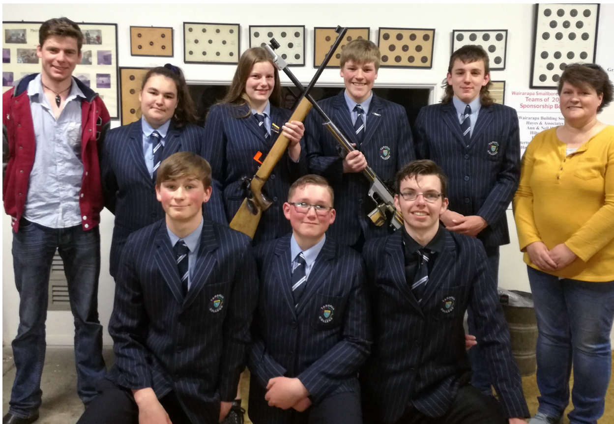
TC Small Bore Shooting Team