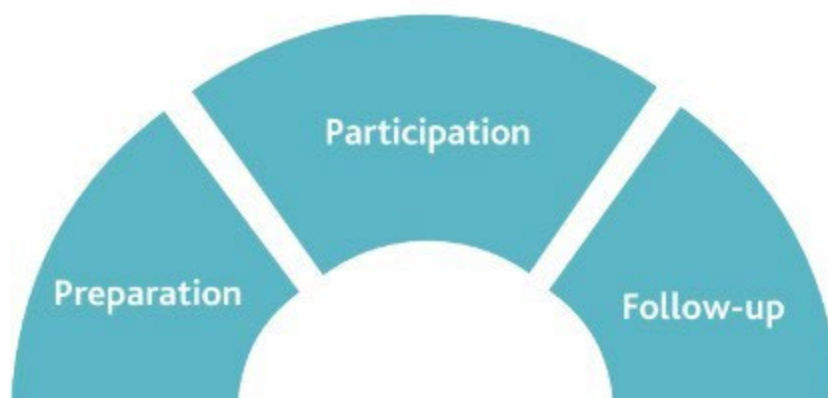
FIGURE 3: THE THREE PHASES OF PB4L RESTORATIVE PRACTICE