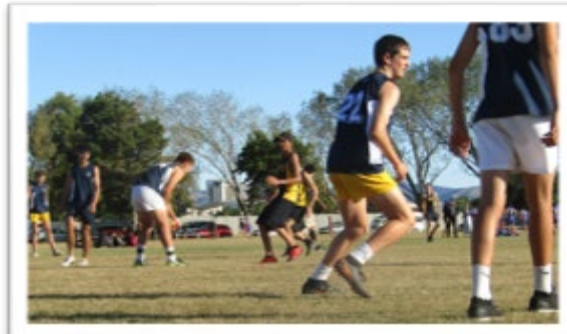
Small Bore Shooting Touch Rugby